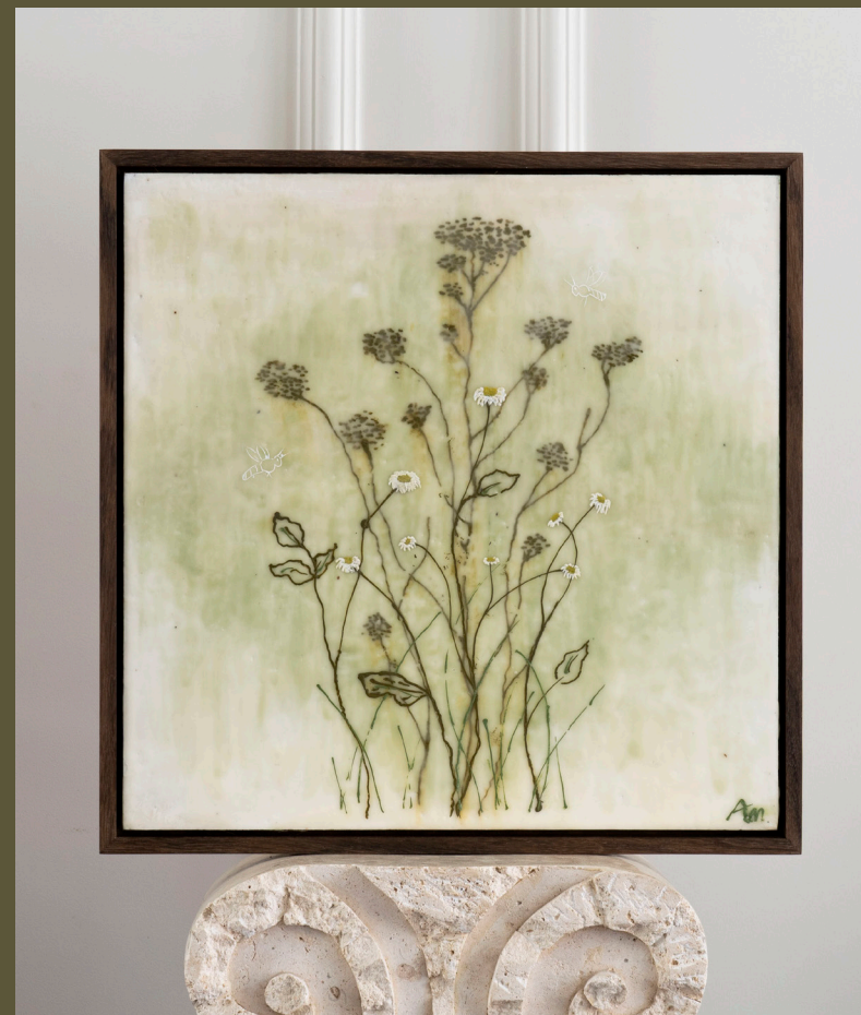
Let us remember | 40x40cm Encaustic & oil on wood Handmade ovangkol frame SOLD