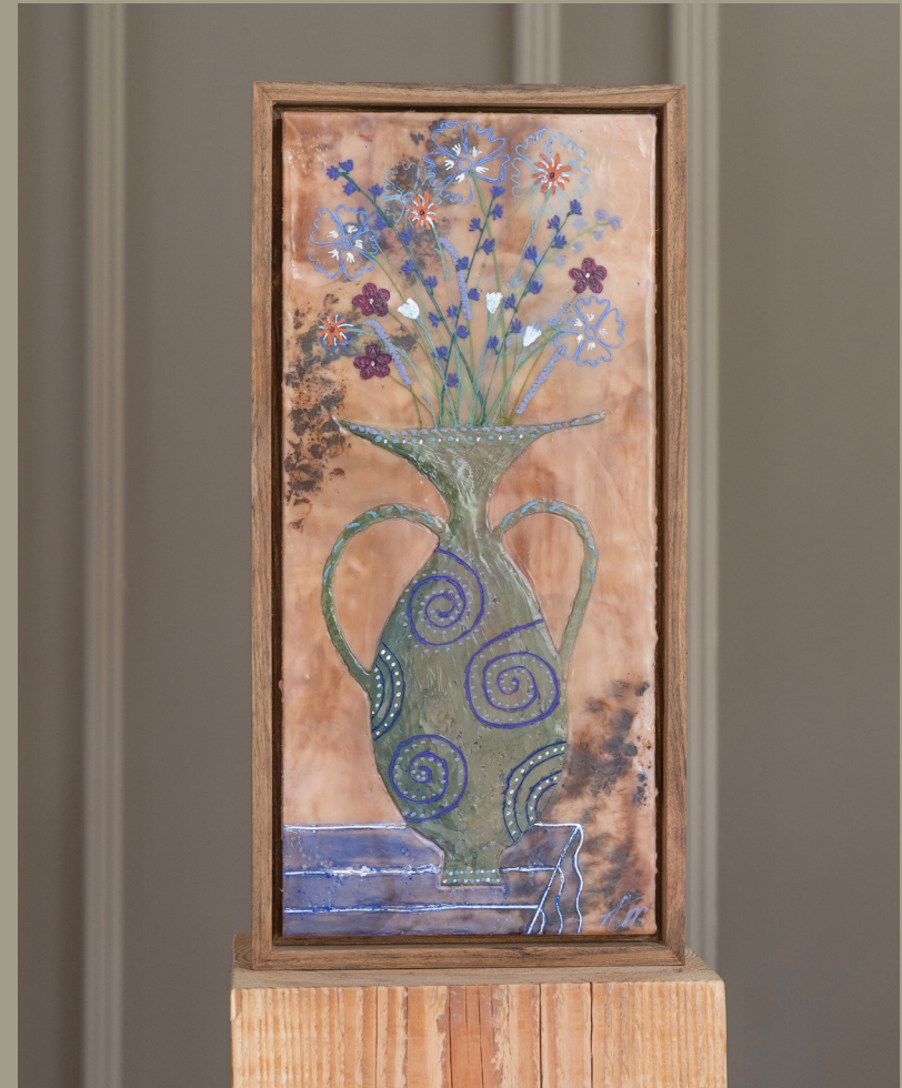
All from the same pot | 42x19 cm Encaustic & oil on wood Handmade ovankol frame €400,-