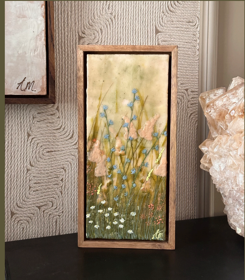
Let us remember Encaustic & oil on wood Handmade ovangkol frame SOLD