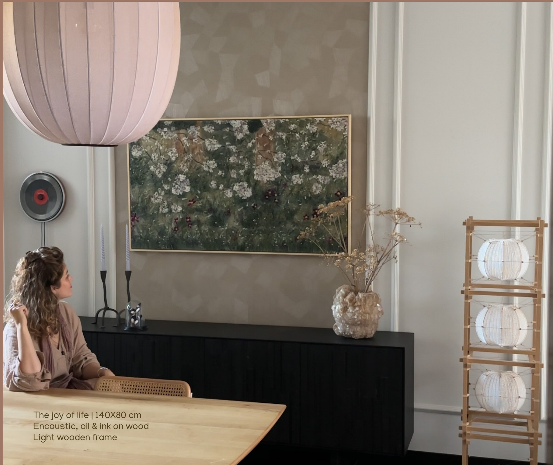
The joy of life | 140X80 cm Encaustic, oil & ink on wood Light wooden frame