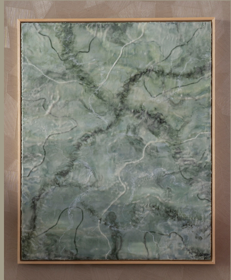
In perfect balance | 100x80cm Encaustic on linen Light wooden frame €2950,-