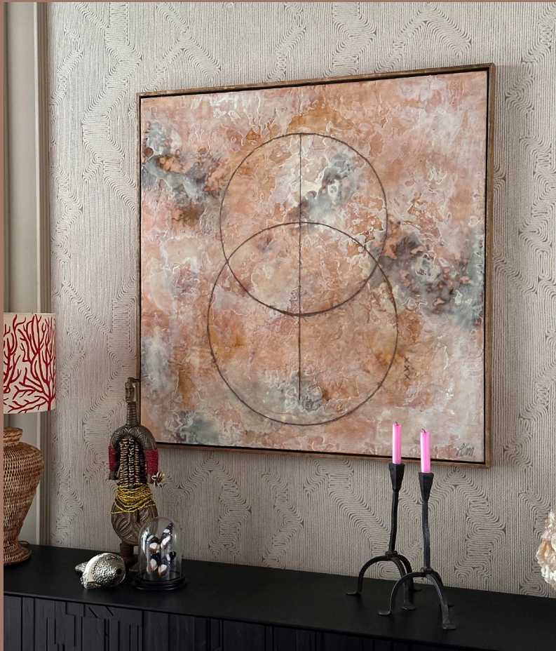
The sacred feminine 100x100 cm Encaustic & oil on wood Handmade ovangkol frame