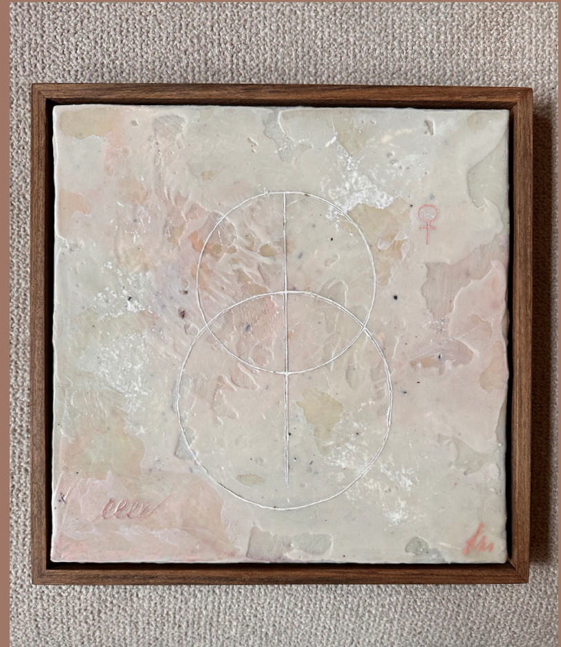
The sacred feminine 30x30cm Encaustic & oil on wood Handmade ovangkol frame