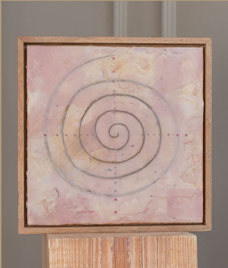
Circle of life III | 30x30 cm Encaustic & oil on wood Handmade ovangkol frame SOLD