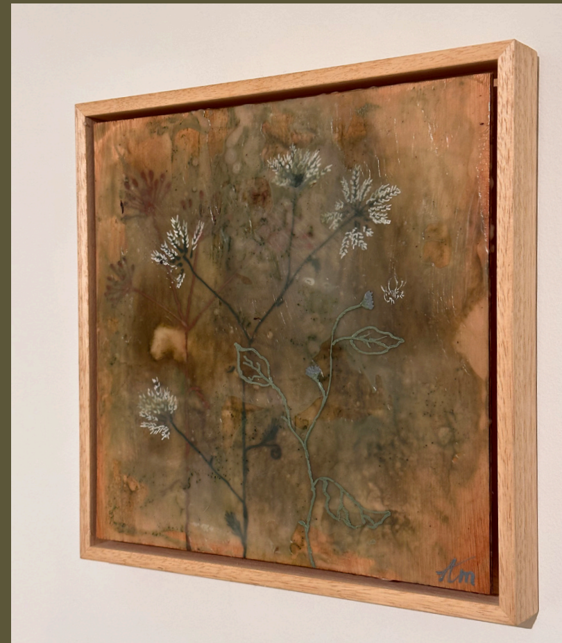
This too shall pass V | 30x30cm Encaustic & oil on wood Light wooden frame €450,-