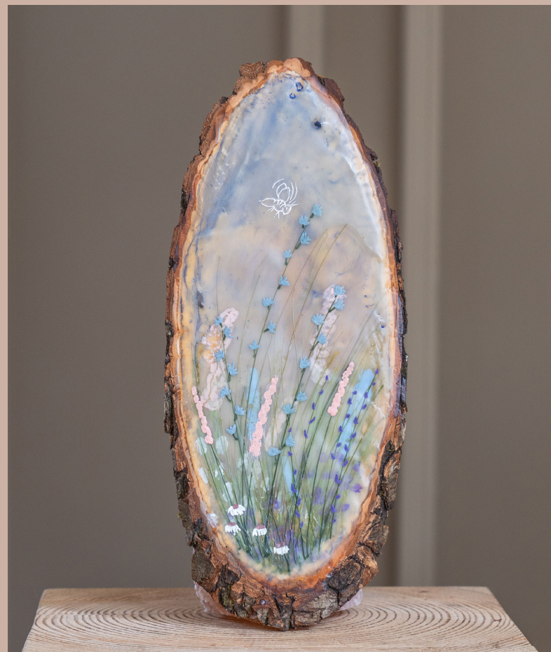
A Little Slice of Heaven IV | 29x13 cm Encaustic & oil on wood €190,-