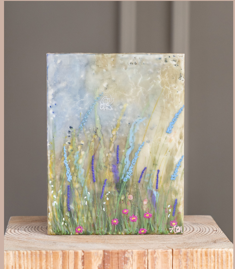
A Little Slice of Heaven II | 20x15 cm Encaustic & oil on wood €150,-