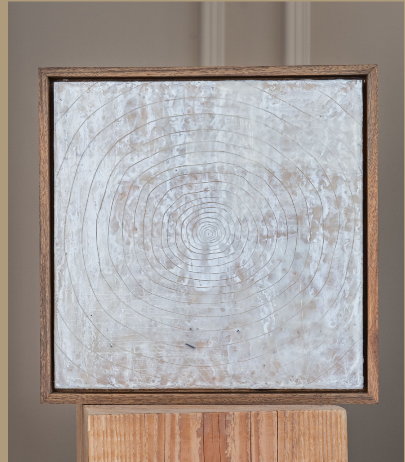
Circle of life IV | 30x30 cm Encaustic on wood Handmade ovangkol frame €450,-