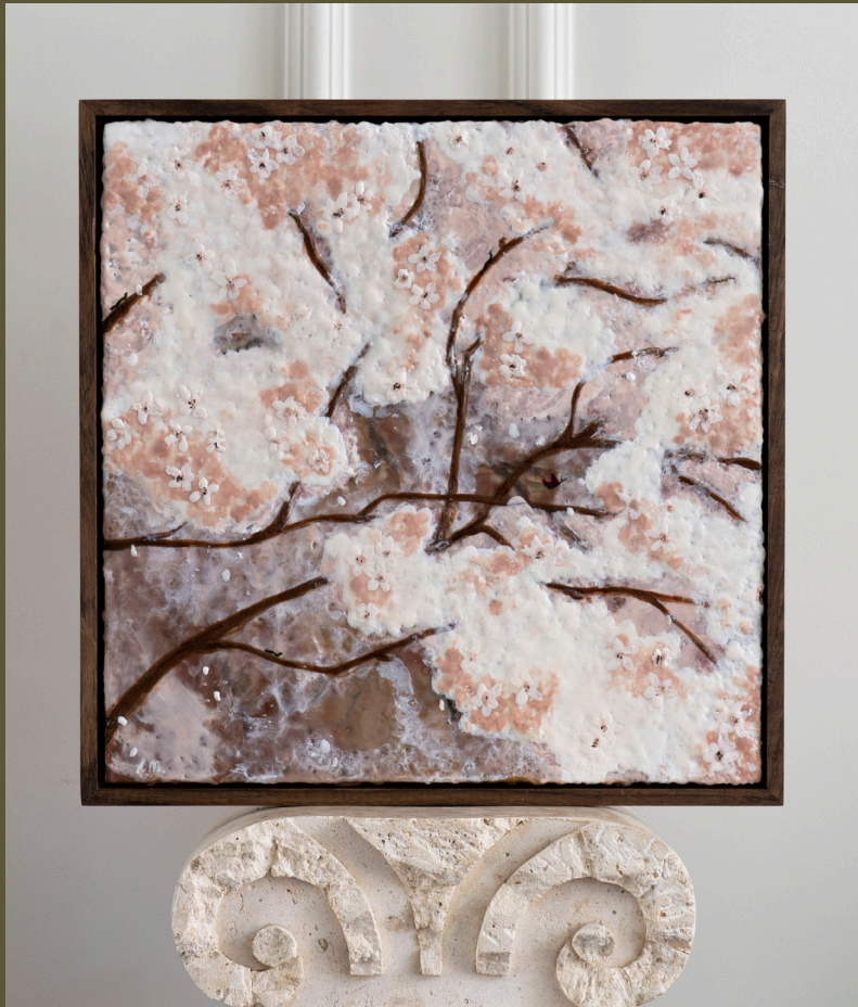
Let us remember | 40x40cm Encaustic & oil on wood Handmade ovangkol frame SOLD