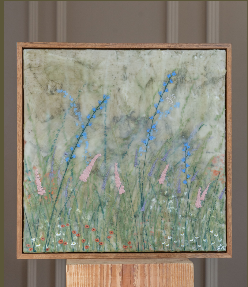
Let us remember | 40x40cm Encaustic & oil on wood Handmade ovankol frame €750,-