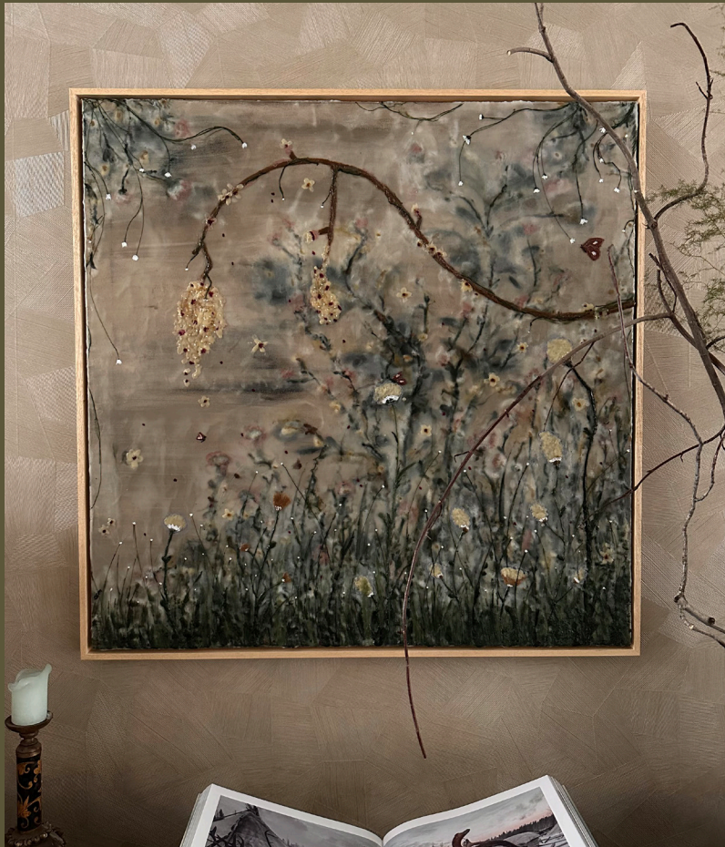
Let us remember | 90x90cm Encaustic on linen Light wooden frame SOLD