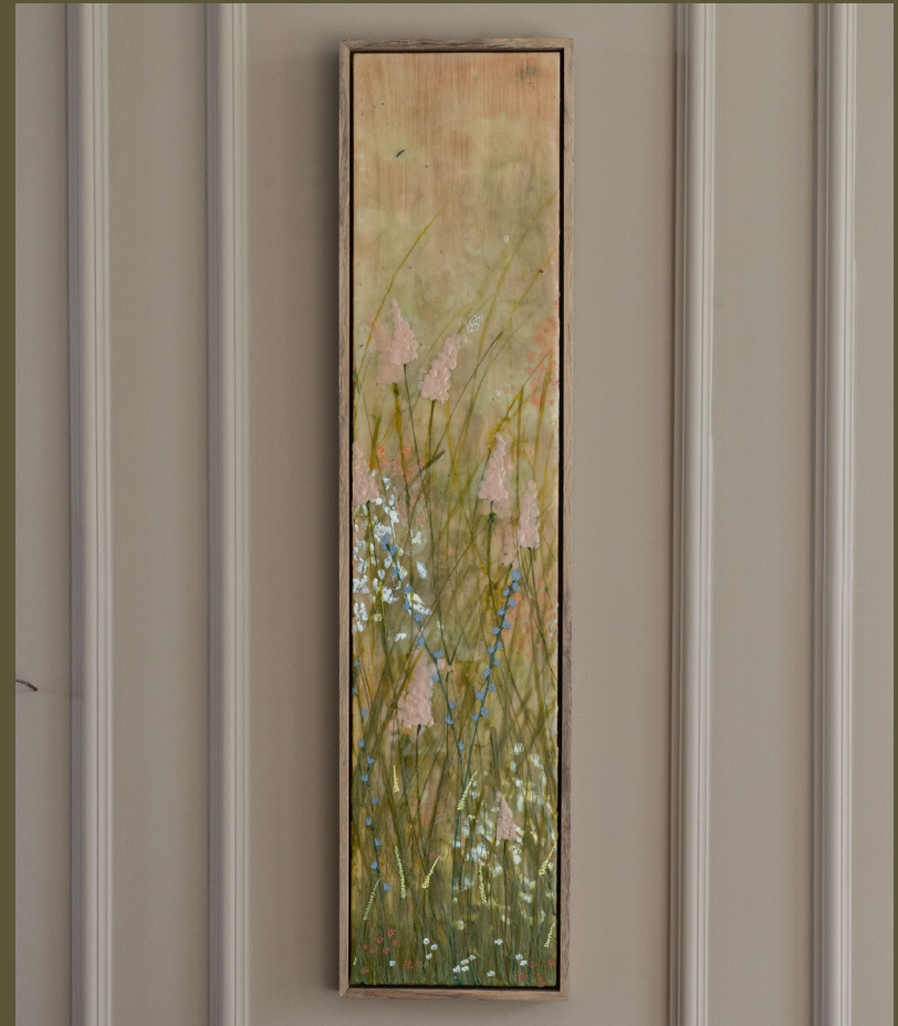
Let us remember | 100x20cm Encaustic & oil on wood Handmade ovangkol frame €1100,-