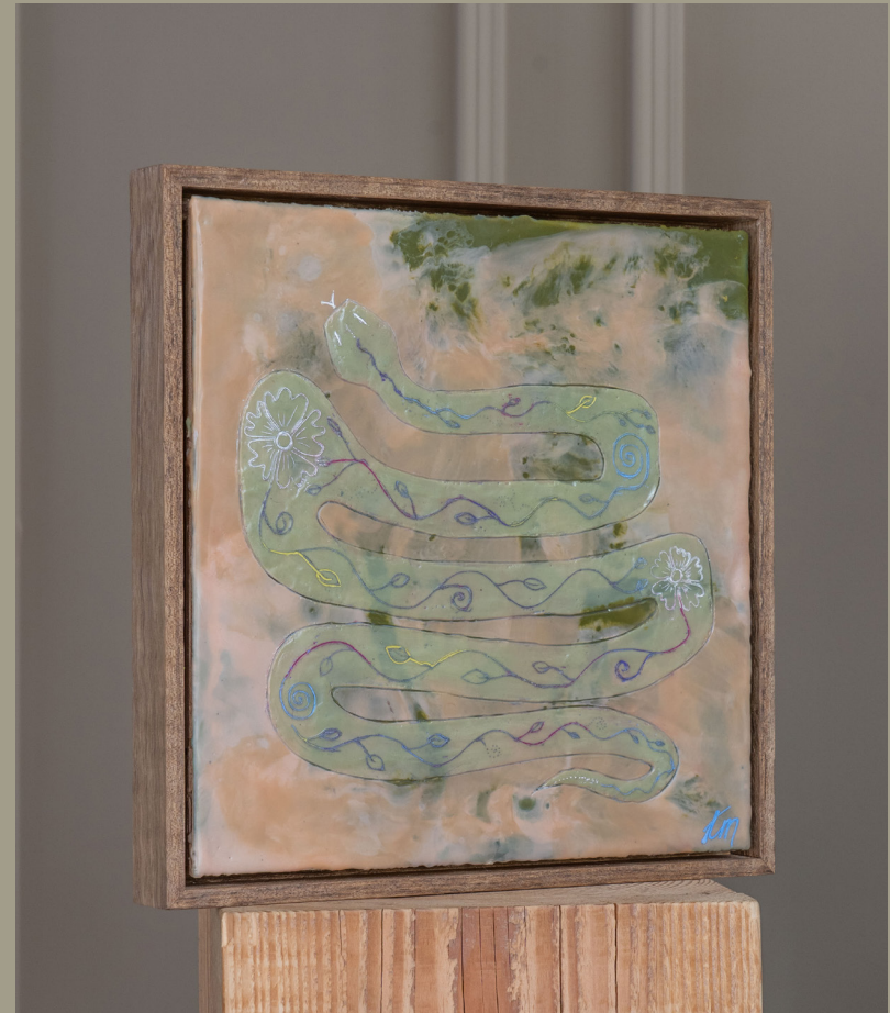
The beauty of becoming II | 30x30cm Encaustic & oil on wood Handmade ovankol frame €450,-