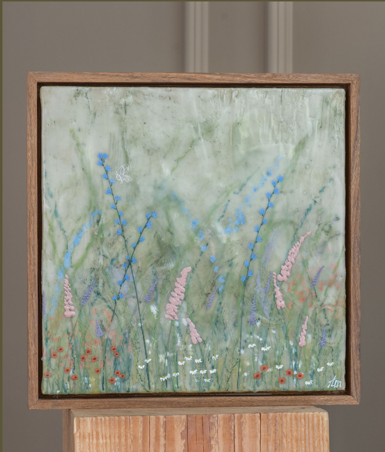
Let us remember | 30x30cm Encaustic & oil on wood Handmade ovangkol frame SOLD