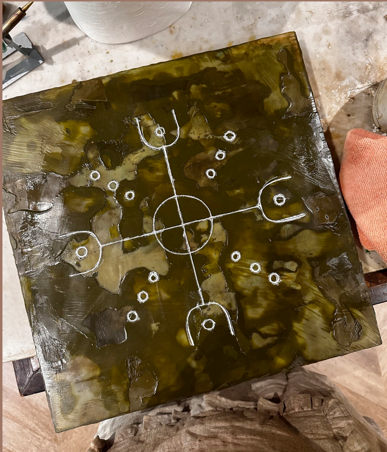
The wild one knows 40x40 cm Encaustic & oil on wood Handmade ovankol frame