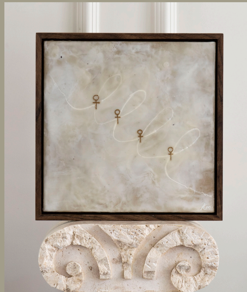
Ancestral knowledge | 30x30cm Encaustic & oil on wood Handmade ovangkol frame SOLD