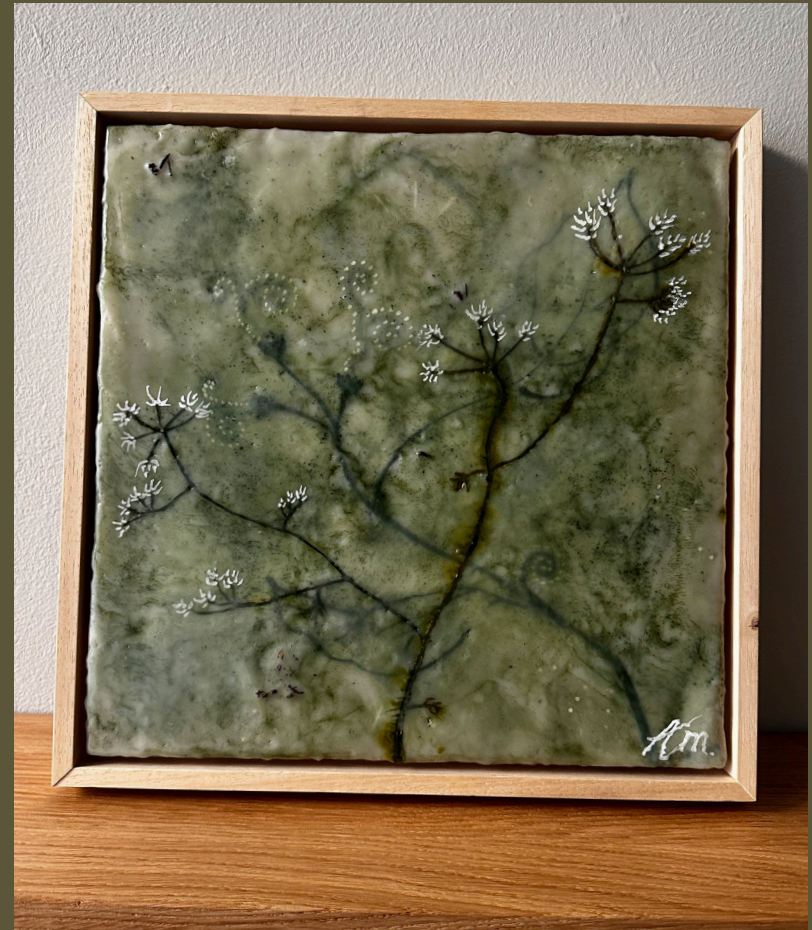
Let us remember | 30x30cm Encaustic & oil on wood Light wooden frame SOLD