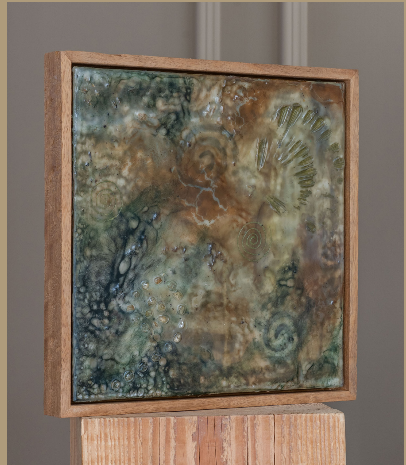
Circle of life VI | 30x30 cm Encaustic, gemstone & oil on wood Handmade ovangkol frame €450,-