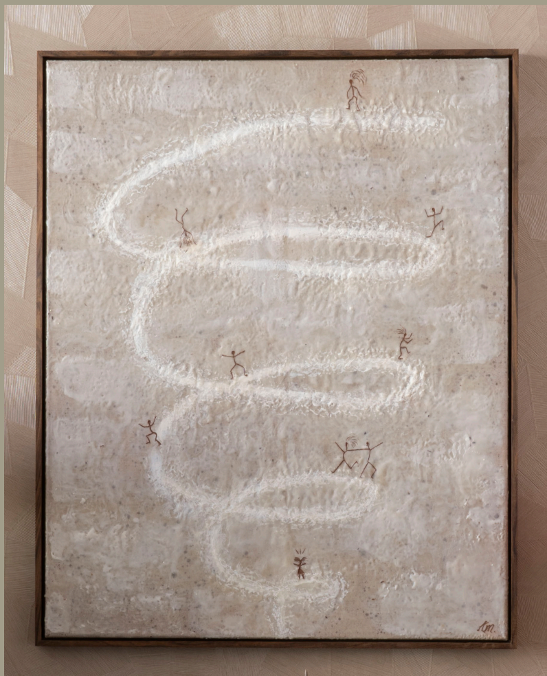
Ancestral support | 100x80 cm Encaustic & oil on linen Handmade ovankol frame €2950,-