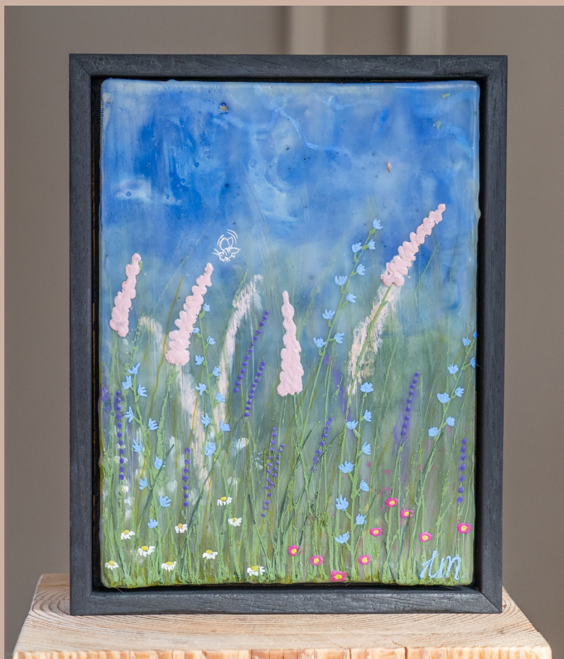
A Little Slice of Heaven VII | 25x20 cm Encaustic & oil on wood Burned wooden frame €250,-