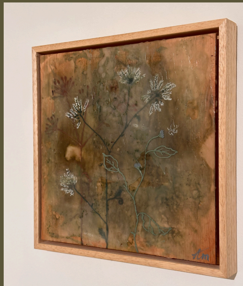
This too shall pass V | 30x30cm Encaustic & oil on wood Light wooden frame €450,-