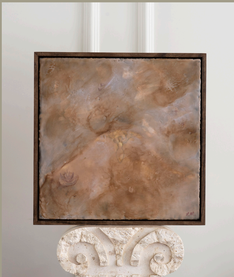
She who carries | 40x40cm Encaustic & oil on wood Handmade ovangkol frame €750,-