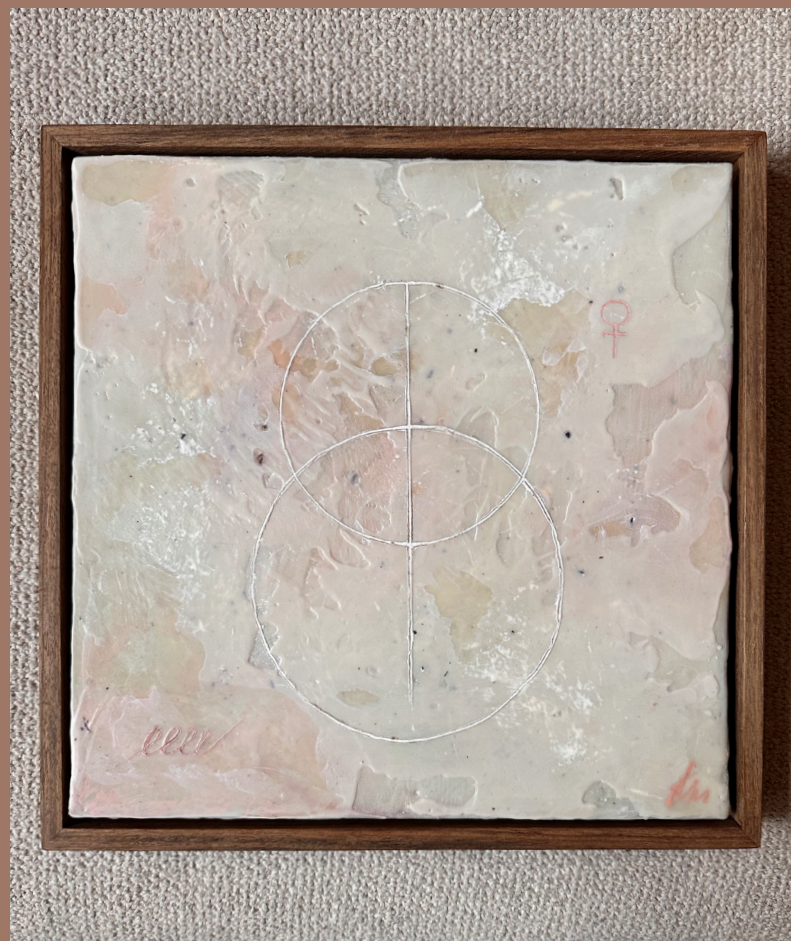
The sacred feminine 30x30cm Encaustic & oil on wood Handmade ovangkol frame