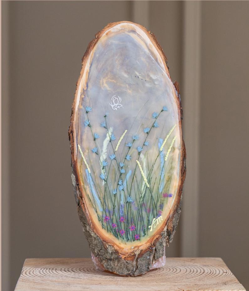
A Little Slice of Heaven III | 29x13 cm Encaustic & oil on wood €190,-