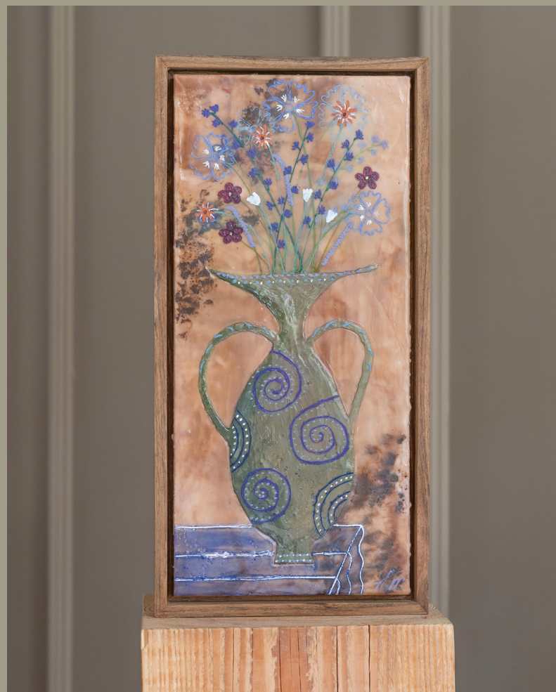
All from the same pot | 42x19 cm Encaustic & oil on wood Handmade ovangkol frame €400,-