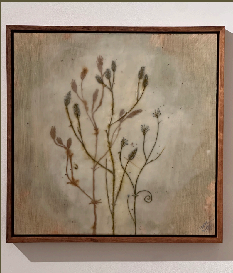
This too shall pass III | 40x40cm Encaustic & oil on wood Handmade ovankol frame €750,-