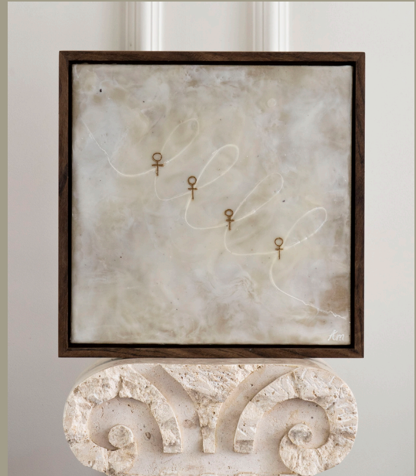
Ancestral knowledge | 30x30cm Encaustic & oil on wood Handmade ovangkol frame SOLD