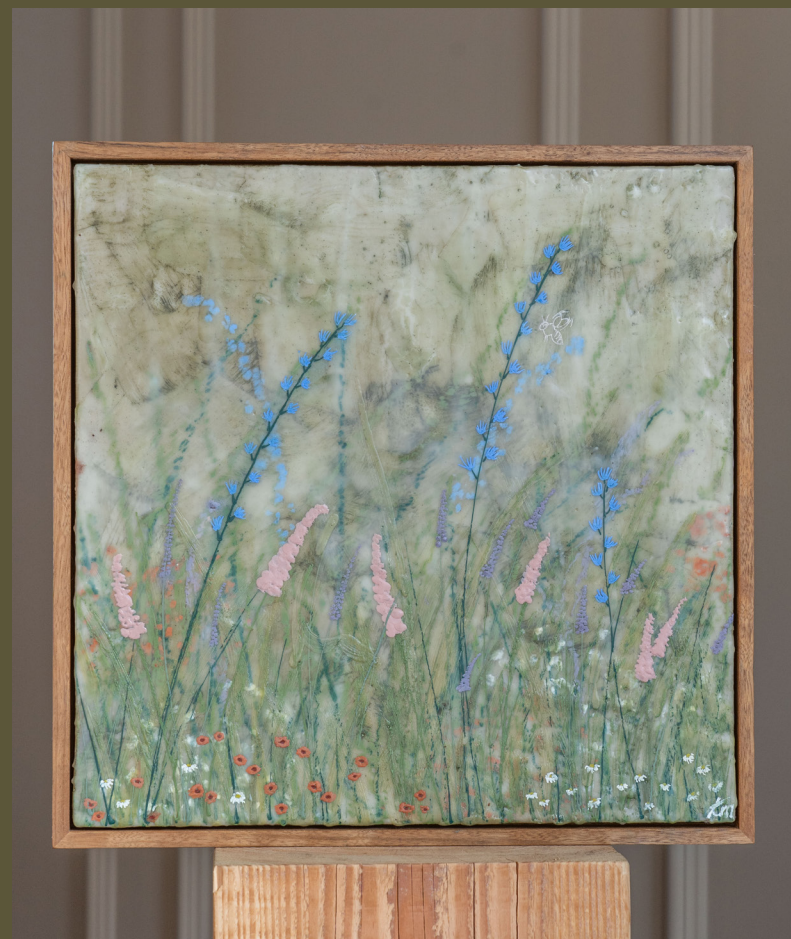
Let us remember | 40x40cm Encaustic & oil on wood Handmade ovankol frame €750,-