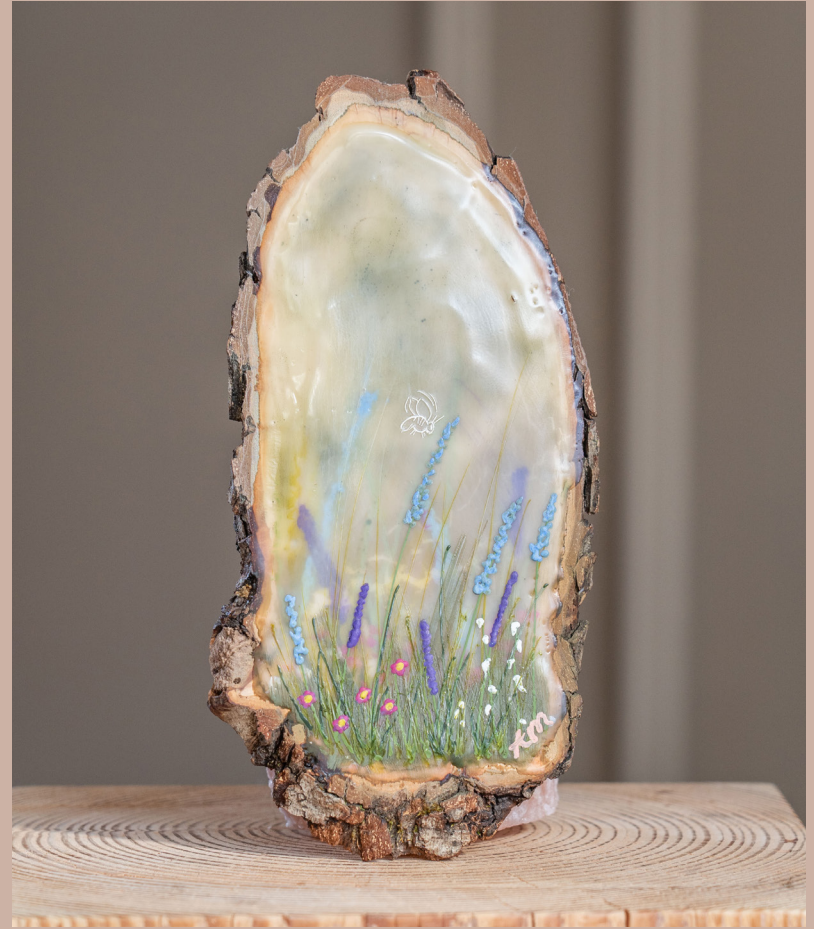
A Little Slice of Heaven VI | 19x9 cm Encaustic & oil on wood €109,-