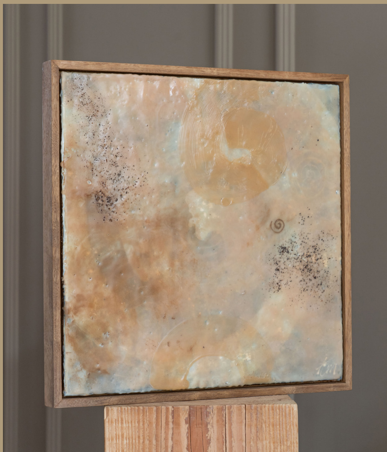
Circle of life V | 40x40 cm Encaustic, earth & oil on wood Handmade ovangkol frame €750,-