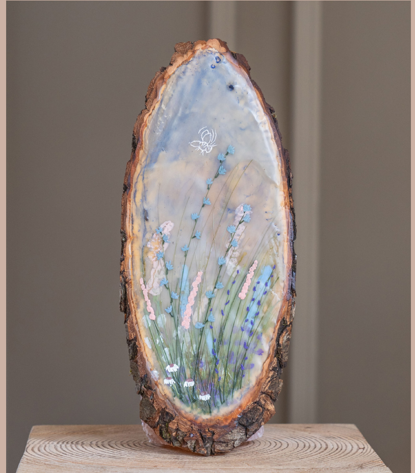
A Little Slice of Heaven IV | 29x13 cm Encaustic & oil on wood €190,-