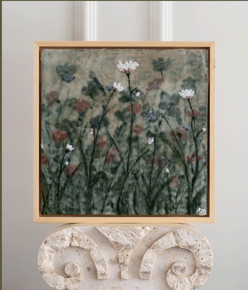
Let us remember | 30x30cm Encaustic & oil on wood Light wooden frame SOLD