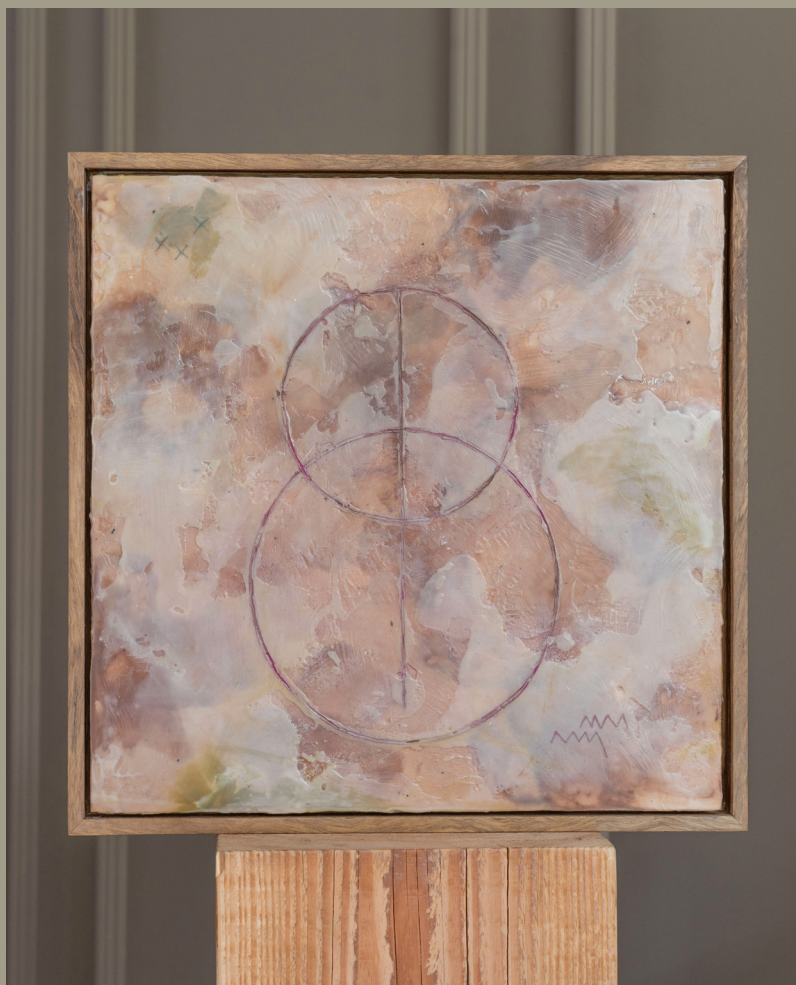
The sacred feminine | 40x40 cm Encaustic & oil on wood Handmade ovangkol frame €750,-