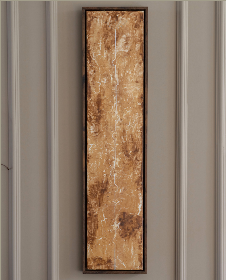
A woman's shoulders I | 100x20cm Encaustic & oil on wood Handmade ovankol frame €1100,-