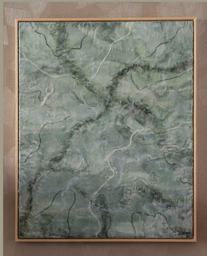
In perfect balance | 100x80cm Encaustic on linen Light wooden frame €2950,-