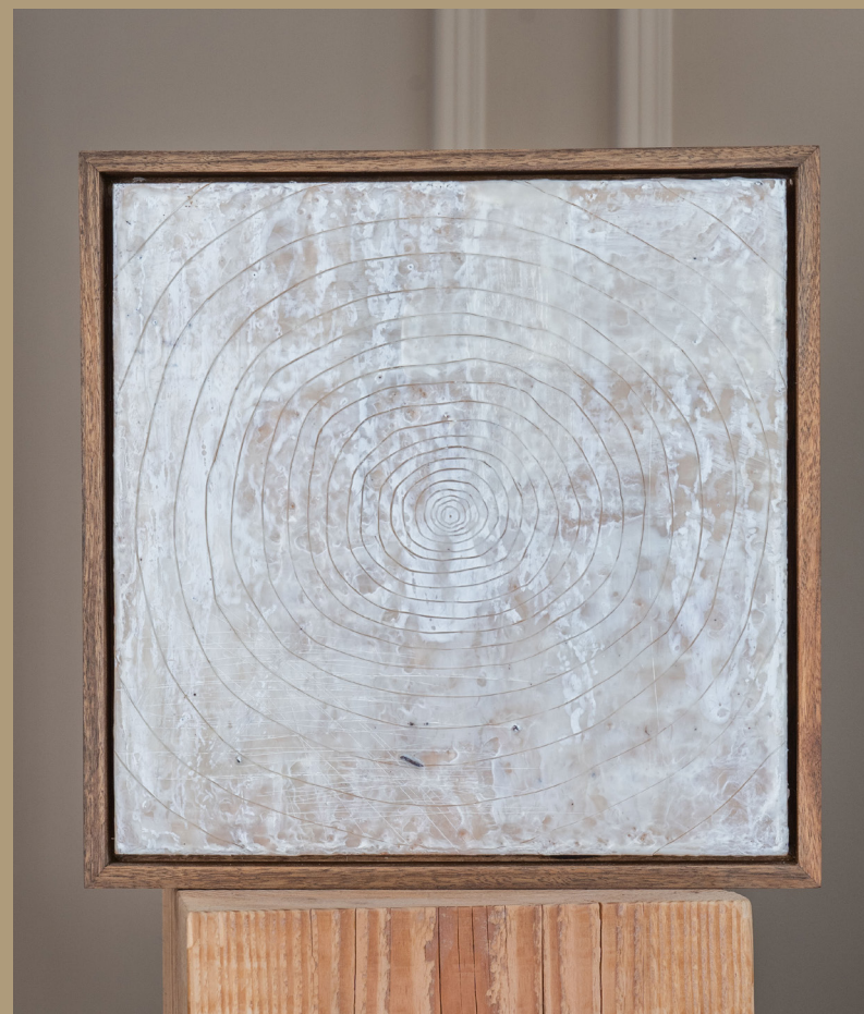
Circle of life IV | 30x30 cm Encaustic on wood Handmade ovankol frame €450,-