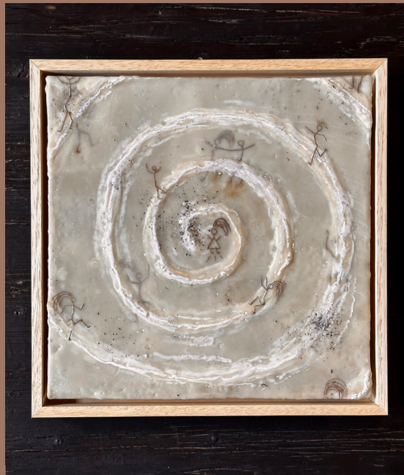
Ancestral wisdom 30x30 cm Encaustic & oil on wood Handmade ovangkol frame