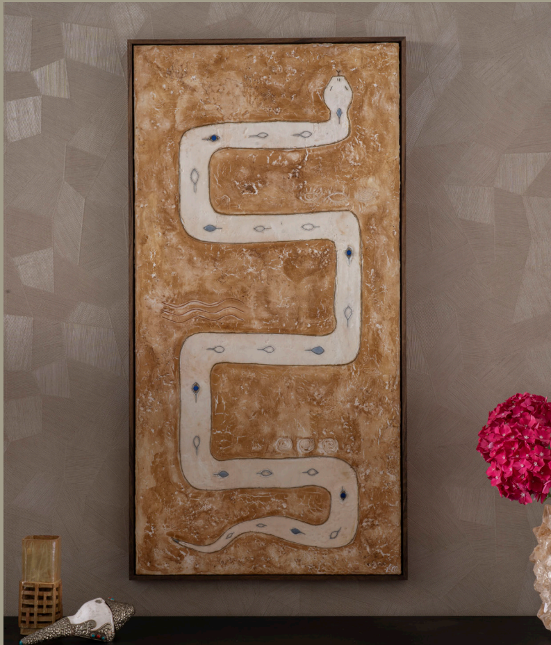
The beauty of becoming | 100x60 cm Encaustic, oil & lapis lazuli on wood Handmade ovankol frame €2750,-