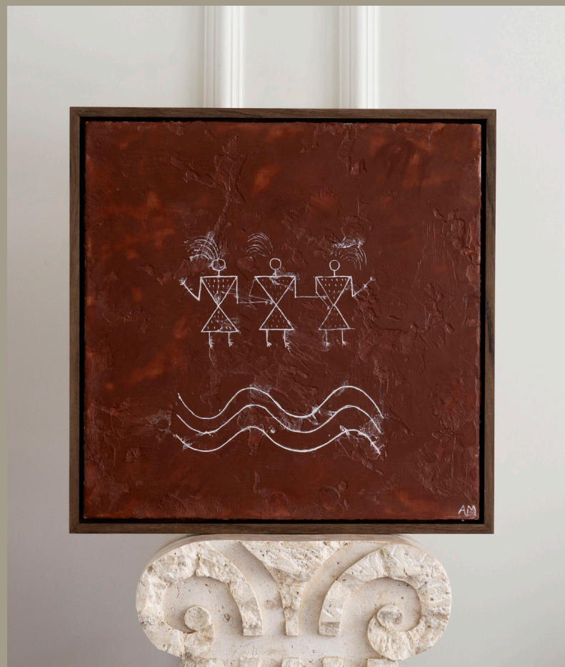
Women dancing | 40x40cm Encaustic & oil on wood Handmade ovangkol frame €750,-