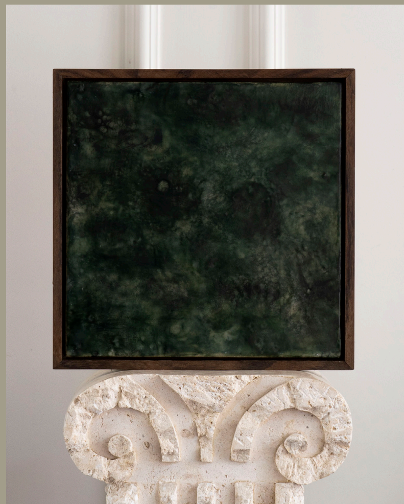
The masculine | 30x30cm Encaustic & ink on wood Handmade ovangkol frame SOLD