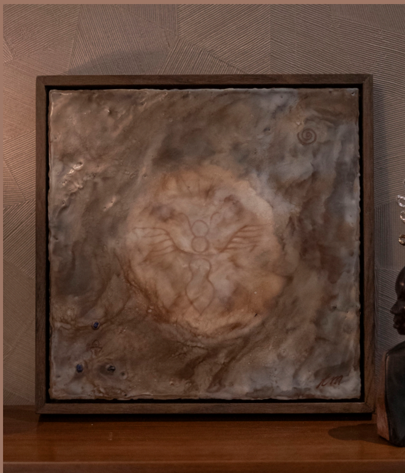
Goddess Aset 30x30 cm Encaustic, oil & lapis on wood Handmade ovangkol frame