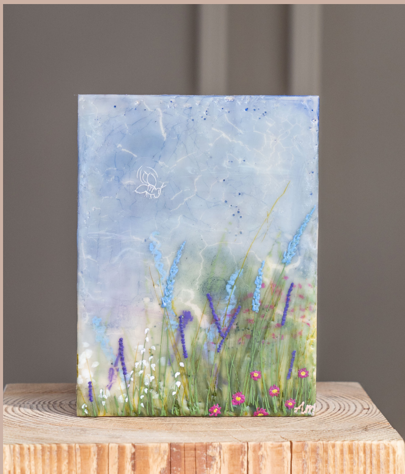
A Little Slice of Heaven I | 20x15 cm Encaustic & oil on wood €150,-