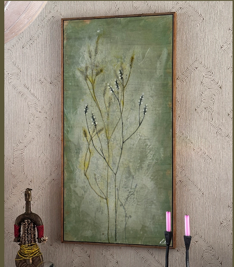
This too shall pass II | 100x60cm Encaustic & oil on wood Handmade ovangkol frame €2750,-