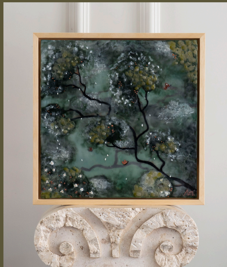
Let us remember | 30x30cm Encaustic, oil & ink on wood Light wooden frame SOLD