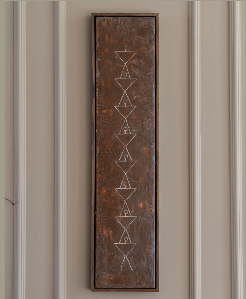
A woman's shoulders II | 100x20cm Encaustic & oil on wood Handmade ovankol frame €1100,-