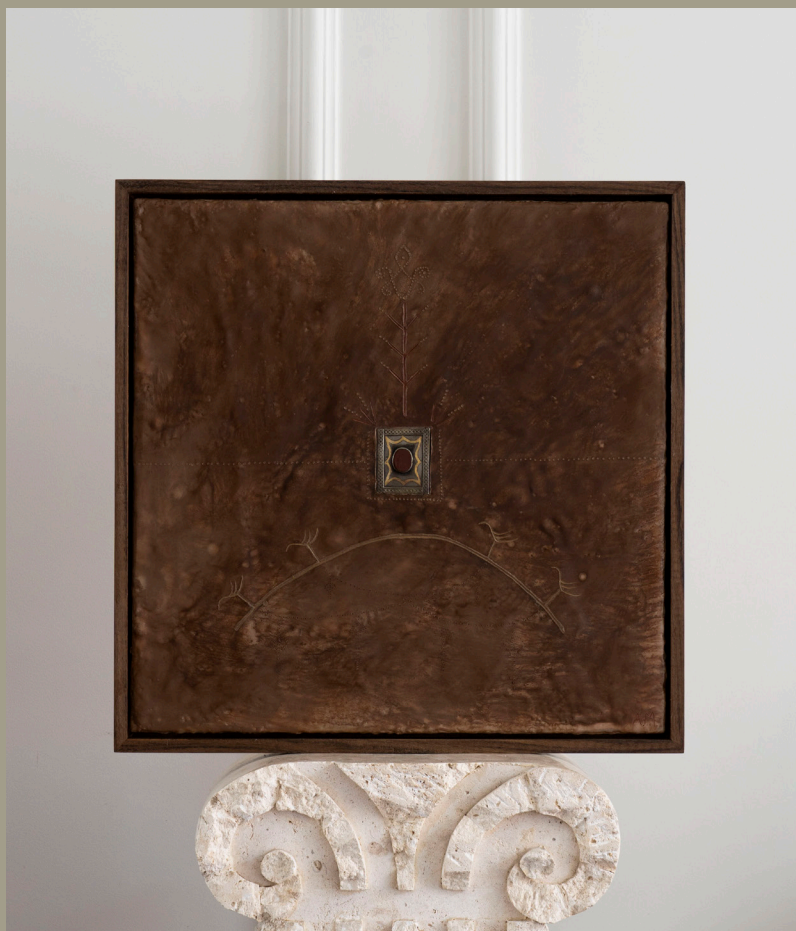
Dream space | 40x40cm Encaustic, oil and pendant on wood Handmade ovankol frame SOLD