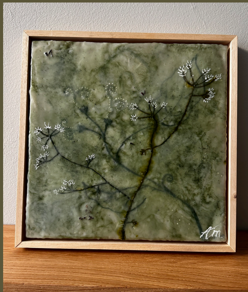
Let us remember | 30x30cm Encaustic & oil on wood Light wooden frame SOLD