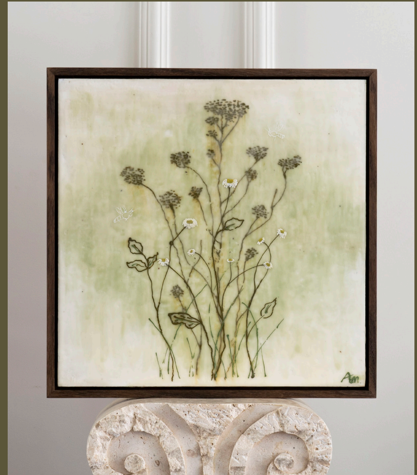
Let us remember | 40x40cm Encaustic & oil on wood Handmade ovangkol frame SOLD