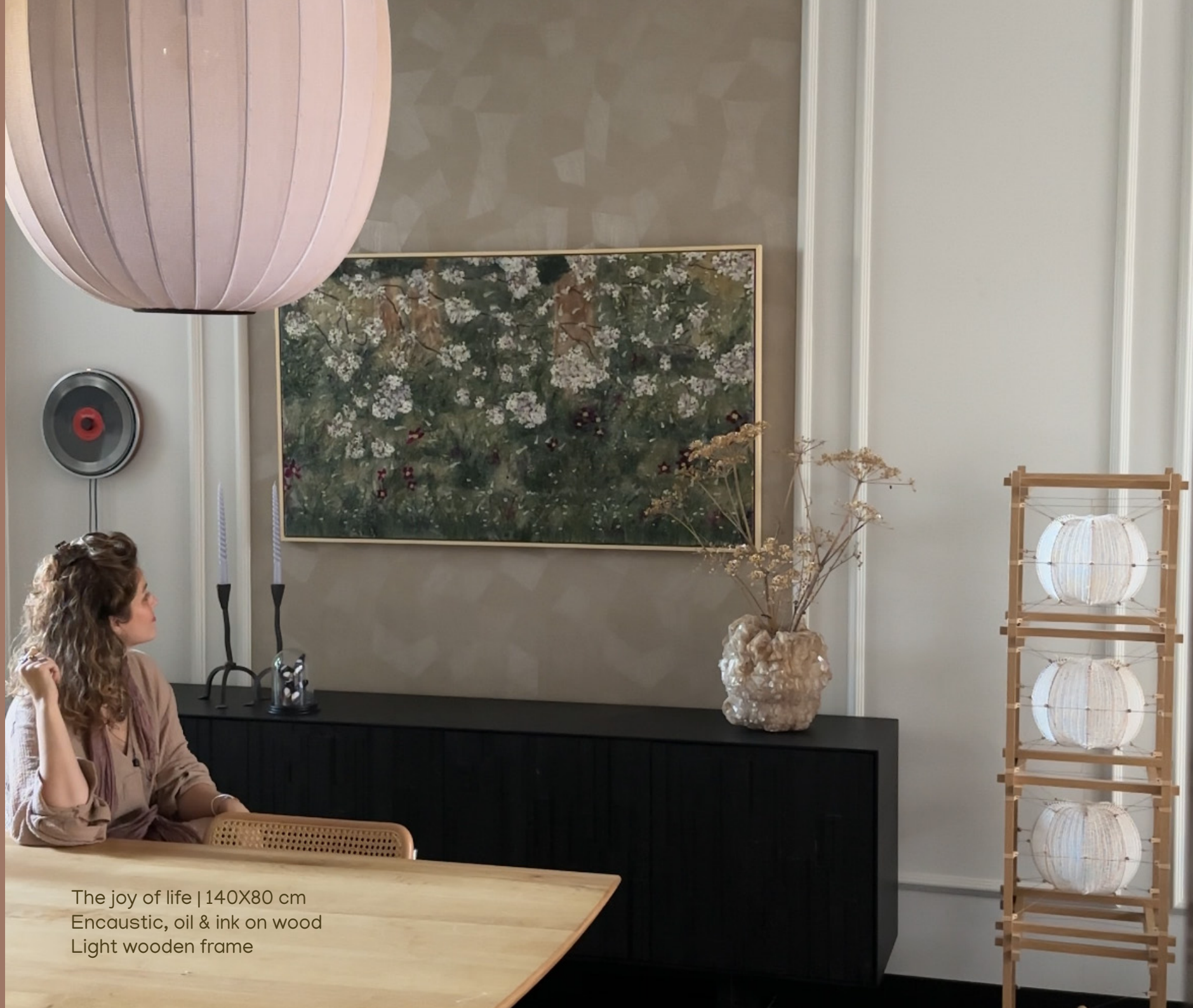
The joy of life | 140X80 cm Encaustic, oil & ink on wood Light wooden frame