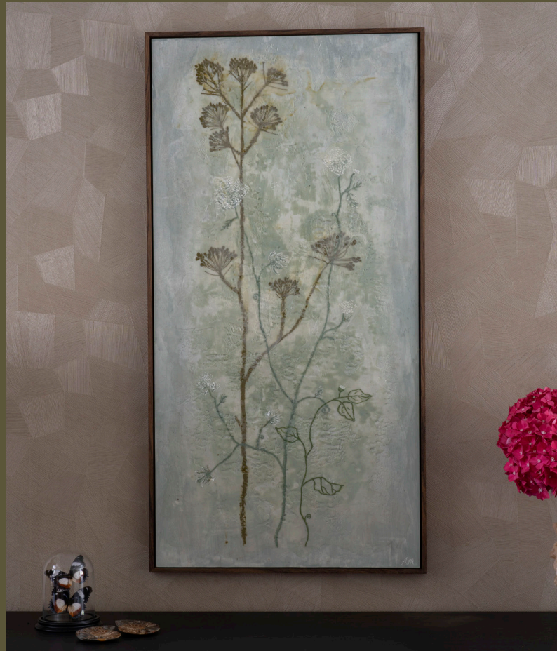
This too shall pass I | 100x60cm Encaustic & oil on wood Handmade ovangkol frame SOLD