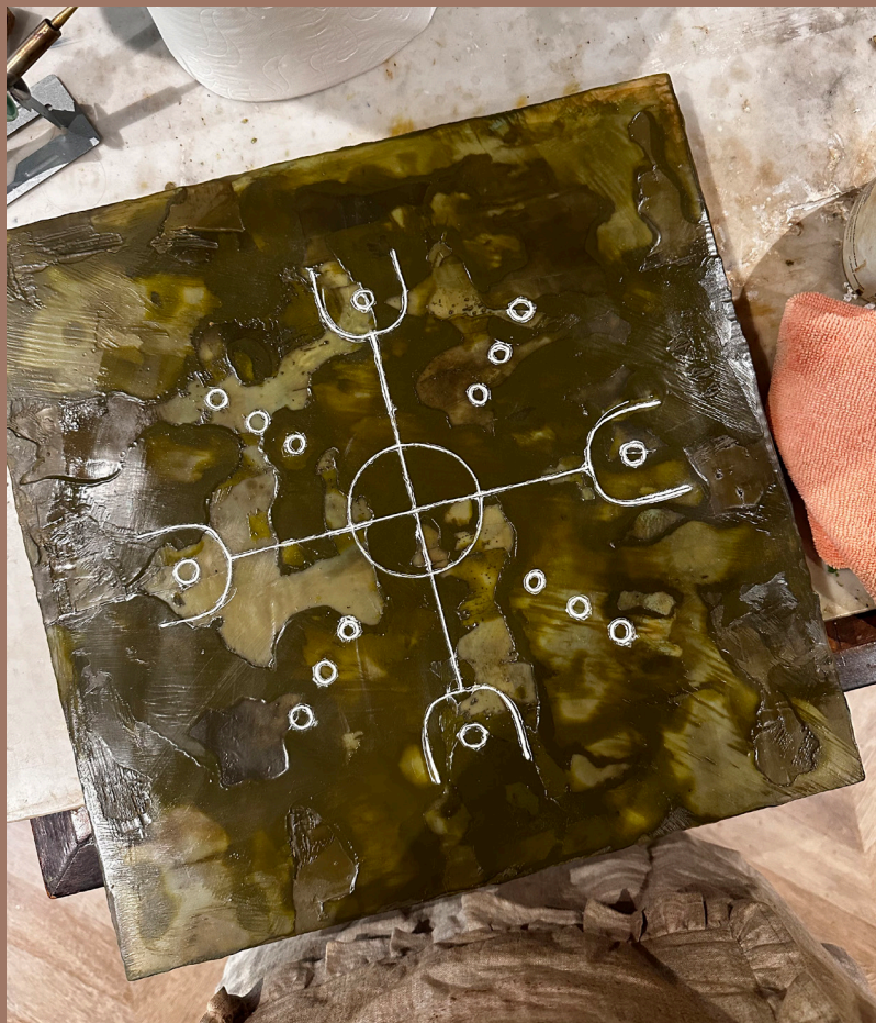
The wild one knows 40x40 cm Encaustic & oil on wood Handmade ovangkol frame