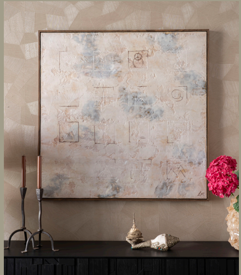
The way of the goddess | 100x100 cm Encaustic & oil on wood Handmade ovangkol frame €3450,-