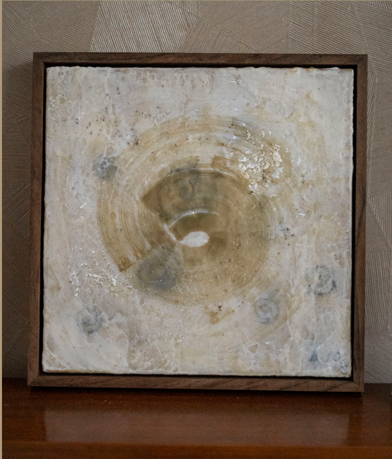
Circle of life I | 30x30 cm Encaustic, earth & oil on wood Handmade ovangkol frame SOLD