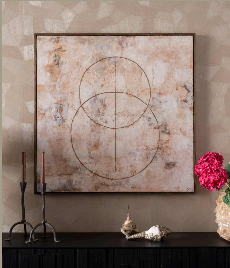
The sacred feminine | 100x100 cm Encaustic & oil on wood Handmade ovangkol frame Private collection