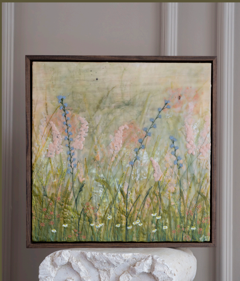
Let us remember | 40x40cm Encaustic & oil on wood Handmade ovankol frame SOLD