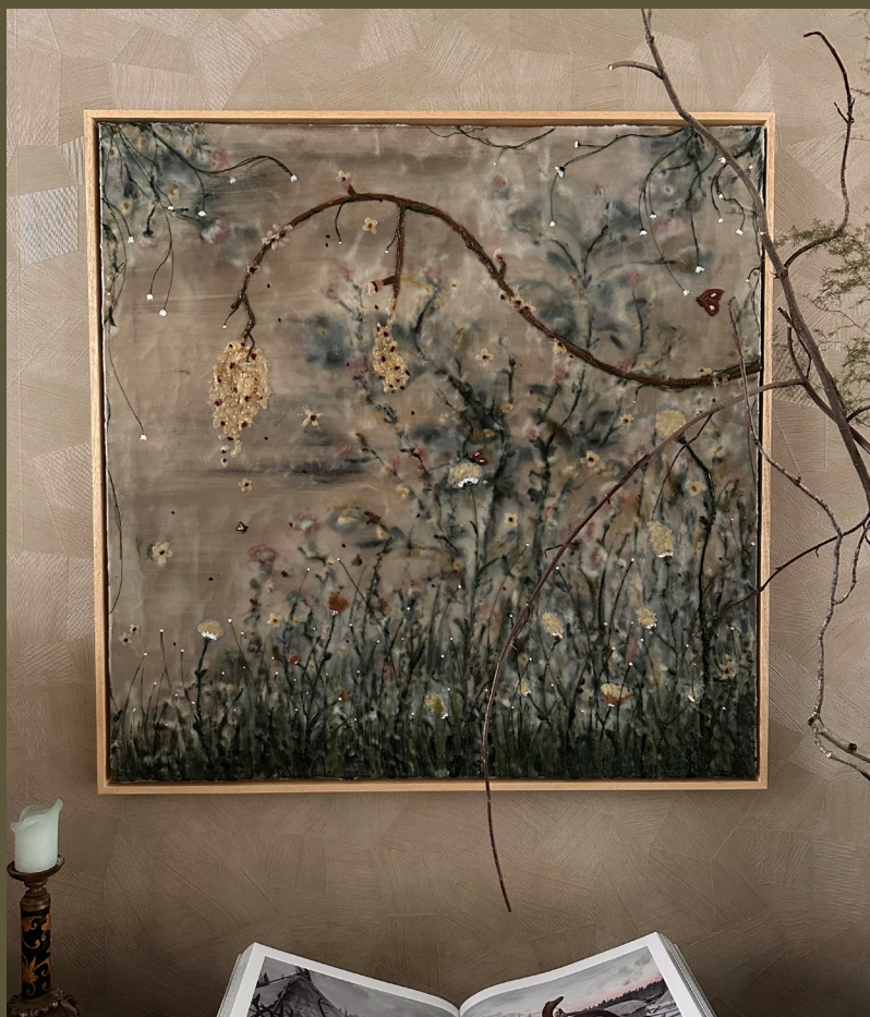
Let us remember | 90x90cm Encaustic on linen Light wooden frame SOLD