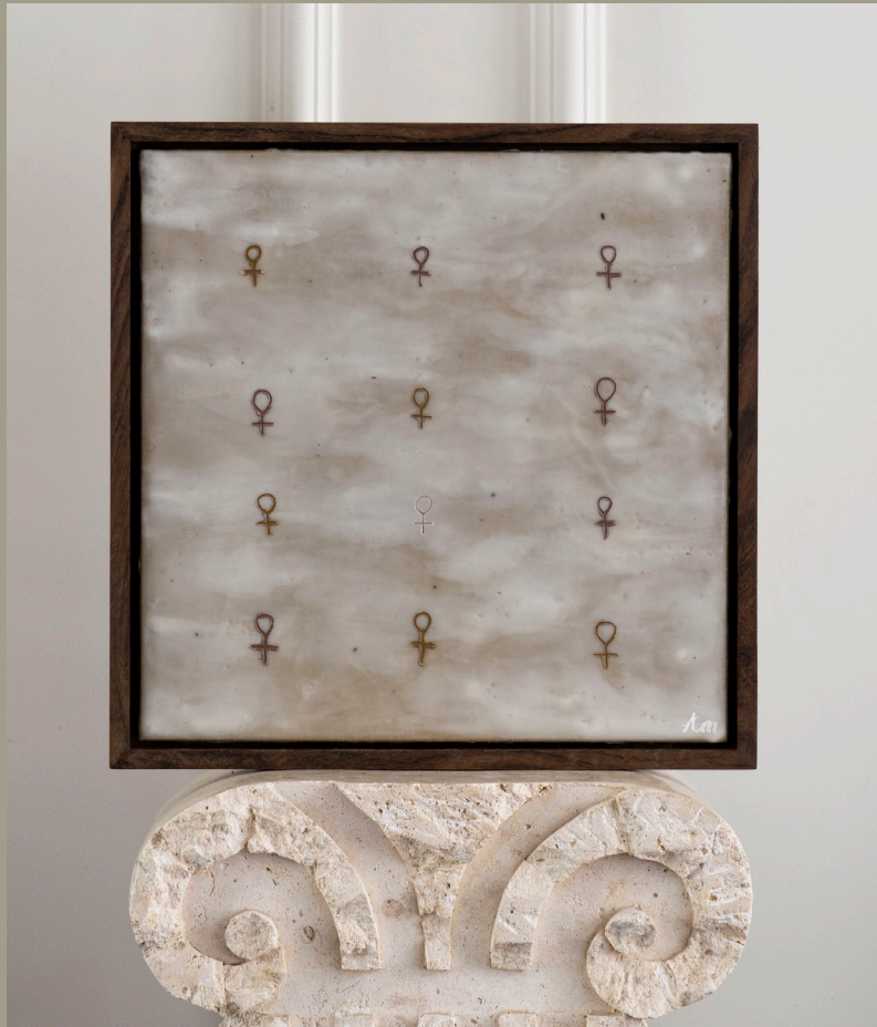
Women who paved the way | 30x30cm Encaustic & oil on wood Handmade ovangkol frame SOLD