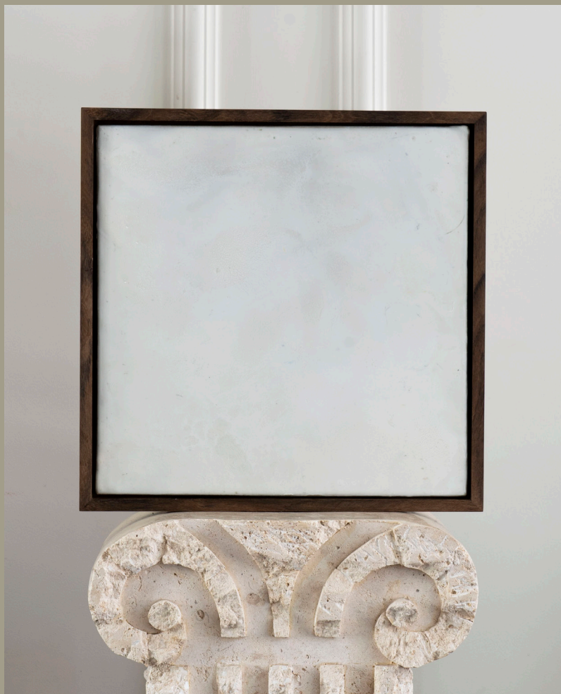
The feminine | 30x30cm Encaustic & ink on wood Handmade ovangkol frame SOLD