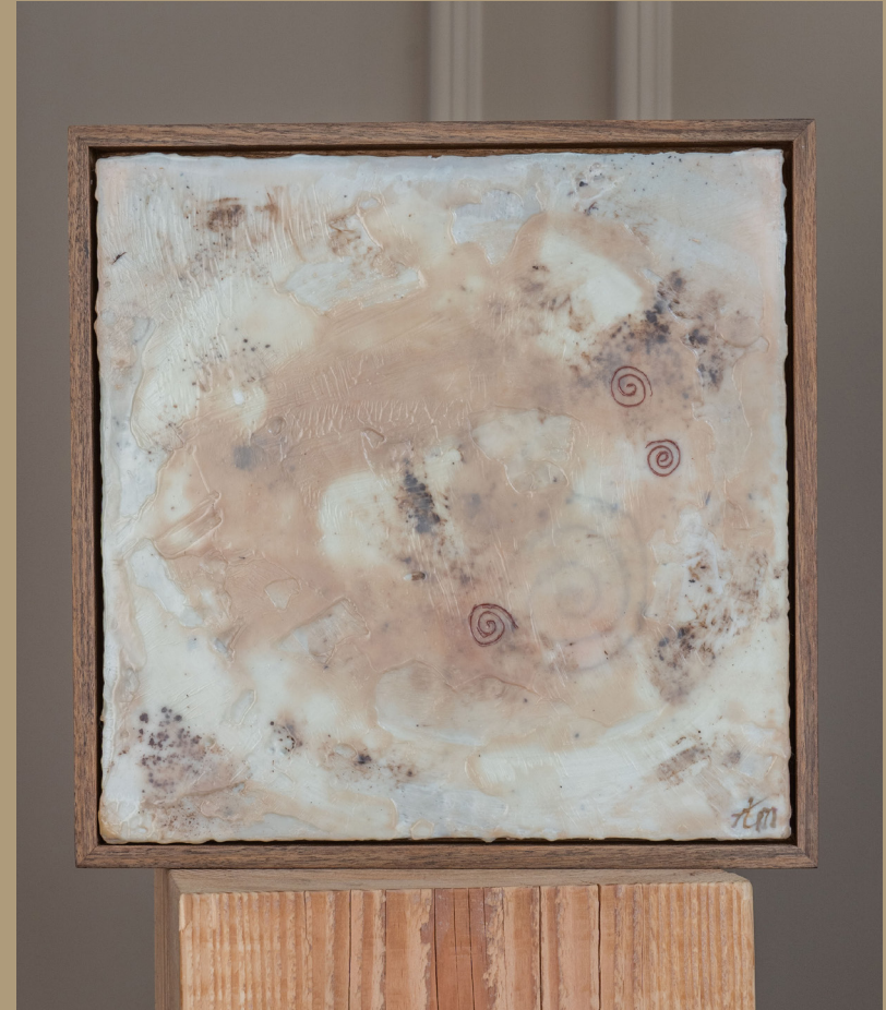
Circle of life II | 30x30 cm Encaustic, earth & oil on wood Handmade ovangkol frame €450,-