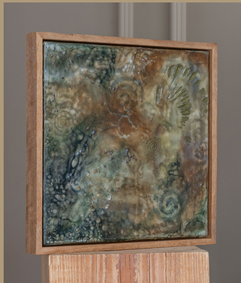
Circle of life VI | 30x30 cm Encaustic, gemstone & oil on wood Handmade ovangkol frame €450,-