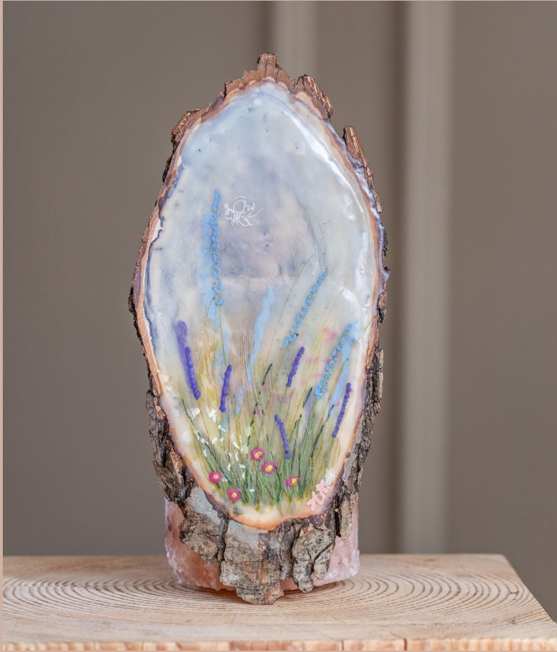
A Little Slice of Heaven V | 19x9 cm Encaustic & oil on wood €109,-