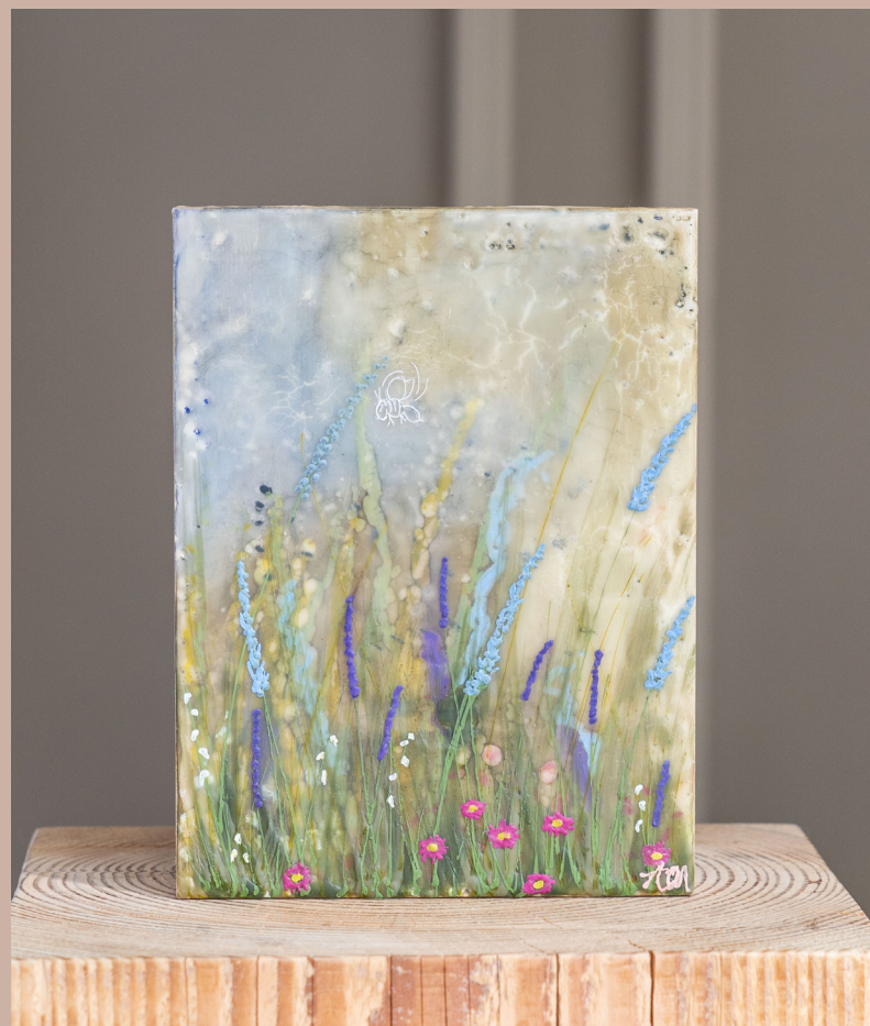
A Little Slice of Heaven II | 20x15 cm Encaustic & oil on wood €150,-