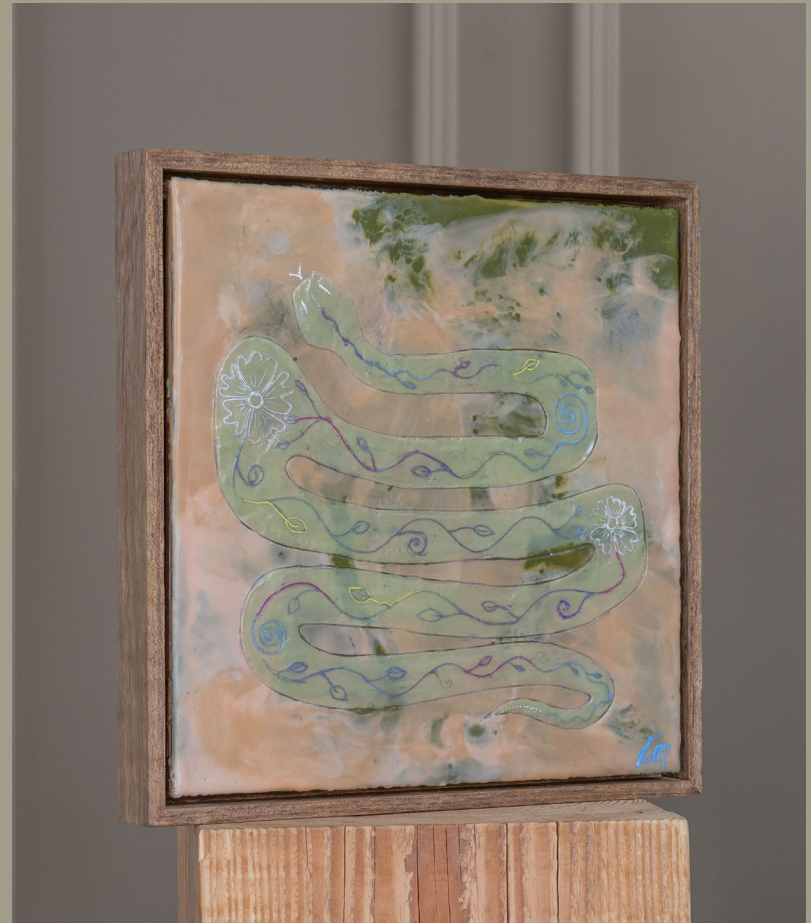
The beauty of becoming II | 30x30cm Encaustic & oil on wood Handmade ovankol frame €450,-