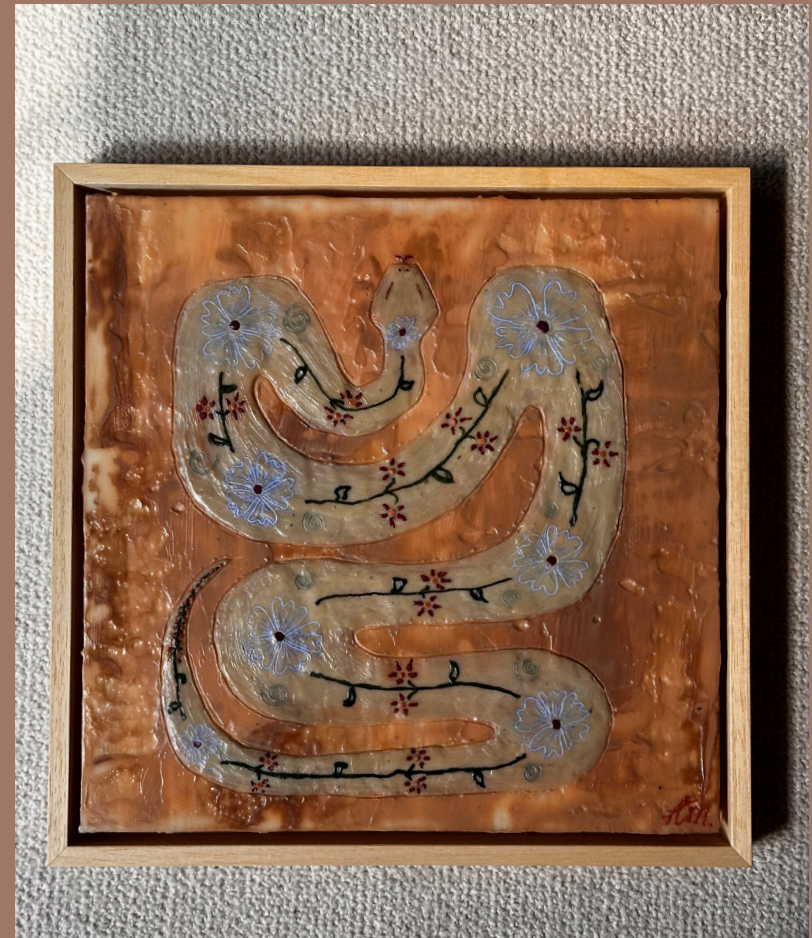
Transformation 30x30 cm Encaustic & oil on wood Light wooden frame