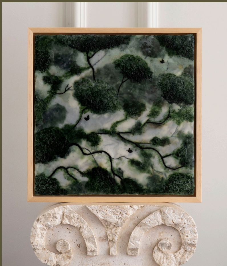
Let us remember | 30x30cm Encaustic, oil & ink on wood Light wooden frame SOLD