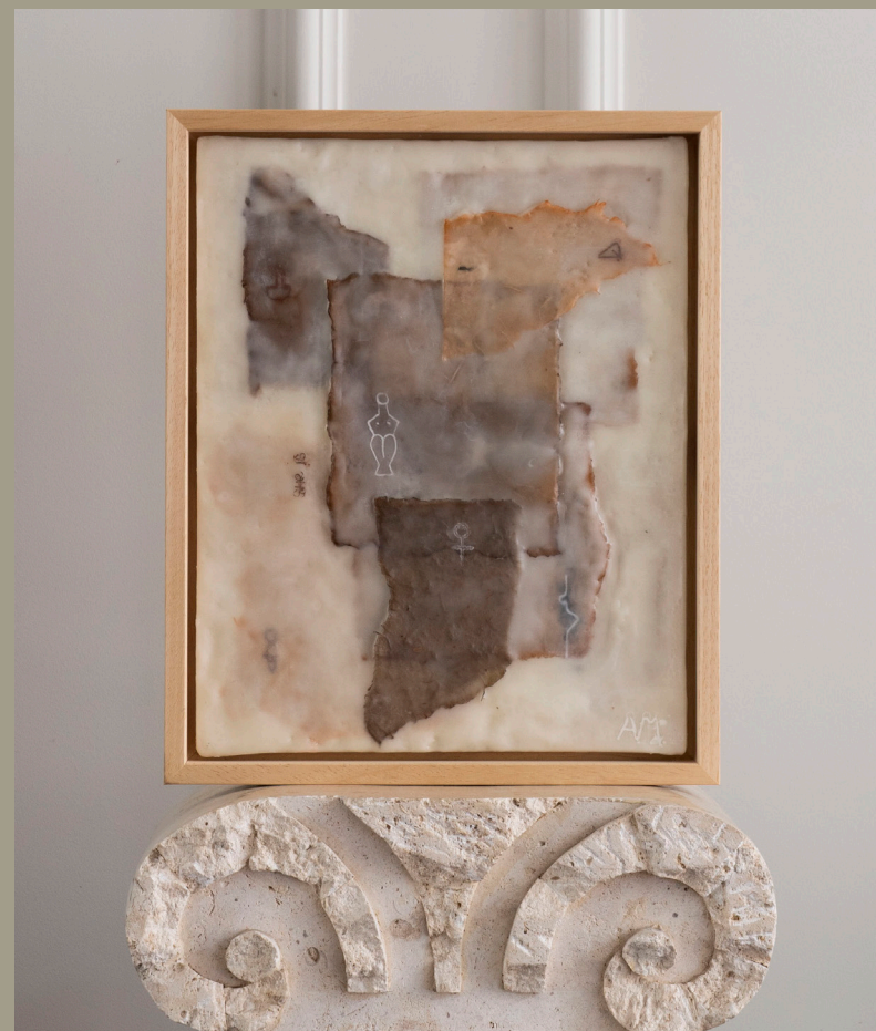
She is | 28x18cm Encaustic & oil on wood Light wooden frame SOLD